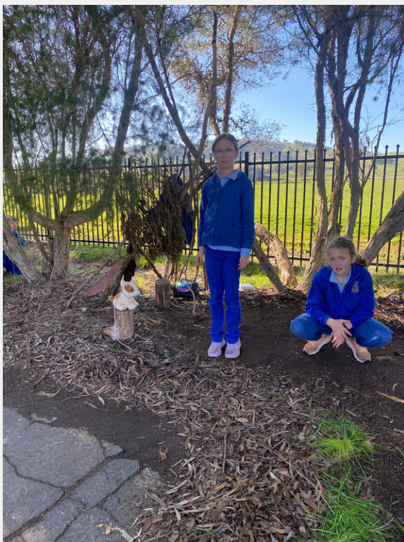
TOP: Our Grounds are looking magnificent at the moment. Far Left: Our Chess Club participants, teaching our budding chess players. Middle: These boys created a homemade quoits. Above: Shops have made a come back.