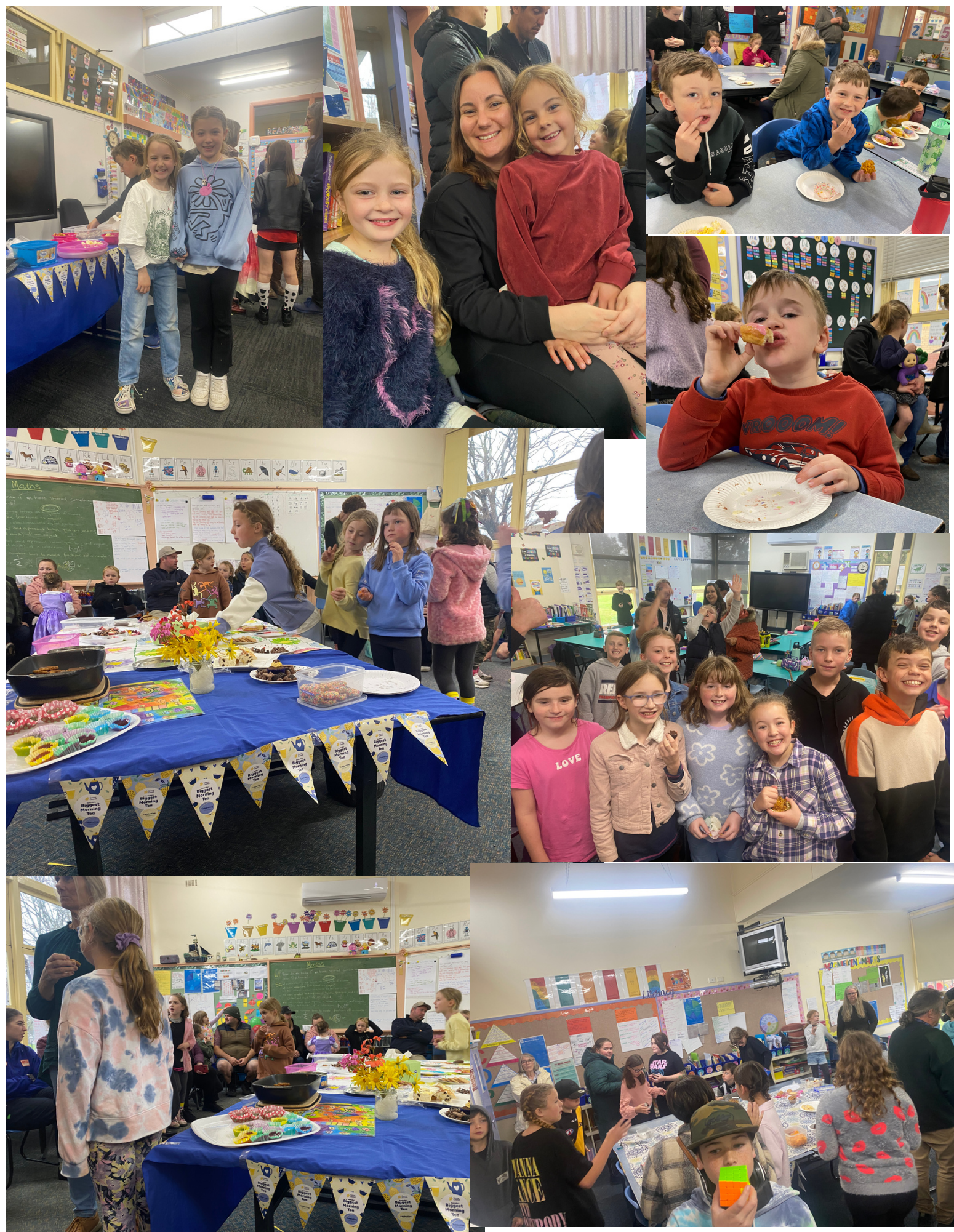
Photos from our Biggest Afternoon Tea. It was a wonderful time to come together and support a great cause as a community.